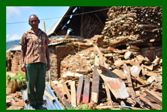
Devastation in Nepal after 2015 earthquake

The Programme also includes an introduction to The World of Red Cross/Red Crescent Societies and a component on Learning to Learn. The month-long Field Practicum / Internship is perhaps the most vital component of the course which brings together all the key theoretical learnings.