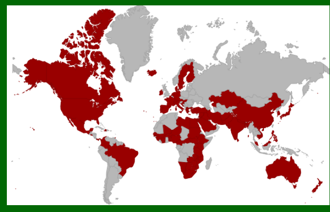
Global Distribution of Participants